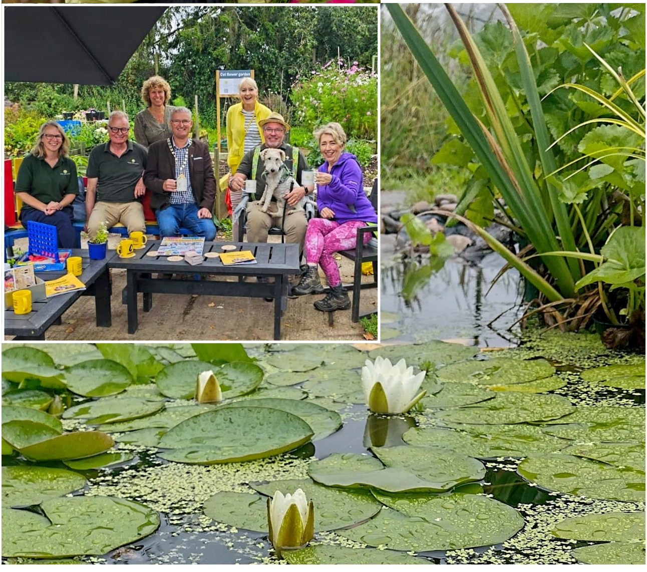
Britannia Square Residents' Association Newsletter – Autumn, 2023